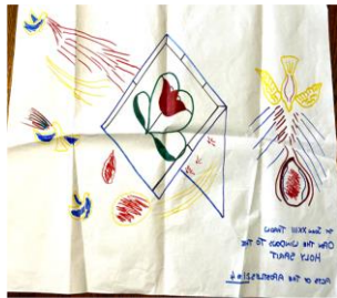
AN OPEN WINDOW