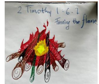
A SMALL SPARK

Share with us what God is revealing to you. Our greatest joy is to make JESUS known through: Spiritual Growth - Community Building - Service and Outreach - Discipleship and Education - Worship and Liturgy - Evangelization - Stewardship